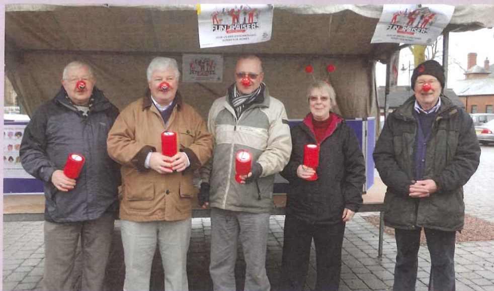
Local Town Councillors supporting Red Nose day by having a stall on Heanor Market Place.