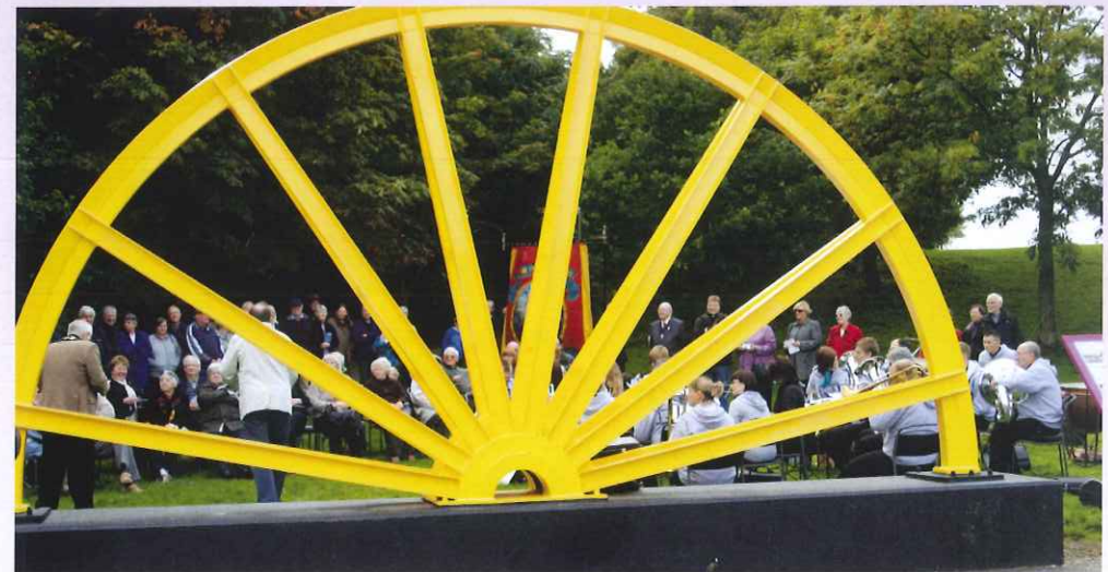
Official Opening of Winding Wheel to commemorate the 40th Anniversary of the Closure of Ormonde Colliery (details inside)

WELCOME to Heanor & Loscoe Town Council's NEWSLETTER. This newsletter is produced to keep you informed about what your Town Council is doing. Copies are available from several sites within the area including Heanor & Loscoe Town Council Office, Loscoe Post Office and Heanor Library.