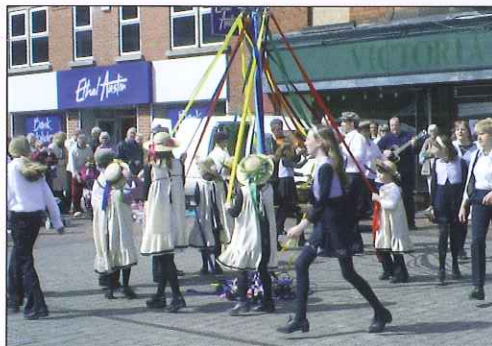
Heage Windmillers perform a traditional Maypole dance.