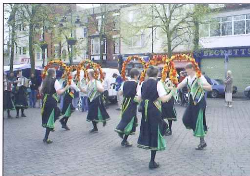
Ripley Green Garters kick up their heels.