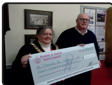
Heanor Pre School