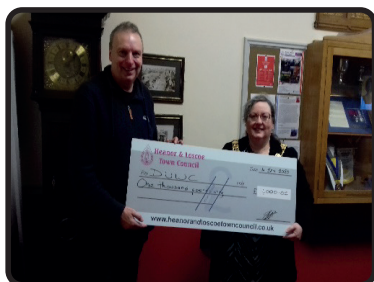
Derbyshire Unemployed Workers Centre

The Town Council has powers conferred by Section 137 of the Local Government Act 1972, to make payments in respect of grants to local organisations. The applications for grant aid are considered at the July and December meetings. If you would like a grant aid form, then please contact the office.