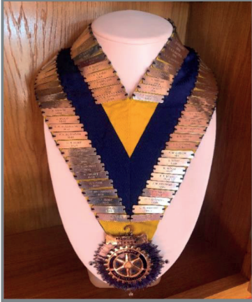
Rotary Club of Heanor Presidential Chain

The Council is committed to saving the Town's Heritage and has a display within the Council Chamber of a number of historic items from local organisations.