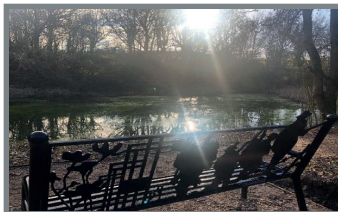
Red River Local Nature Reserve, Loscoe