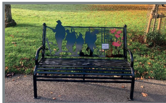
Heanor Memorial Park